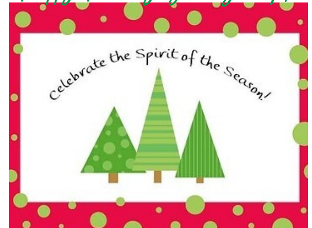
ANNUAL TOWNSHIP HOLIDAY SOCIAL SATURDAY DECEMBER 3rd 6-8PM